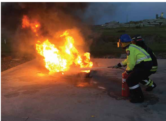
Training: Fire Extinguishers