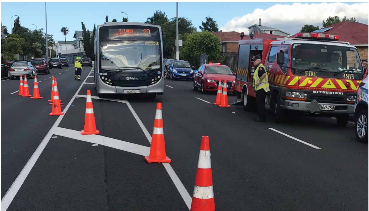
Typical Traffic Management - Kingsland