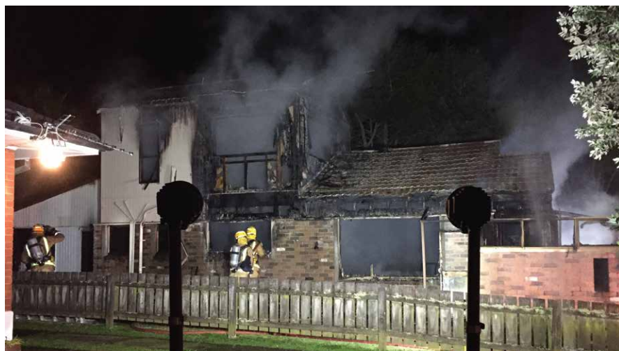
House Fire - Lighting